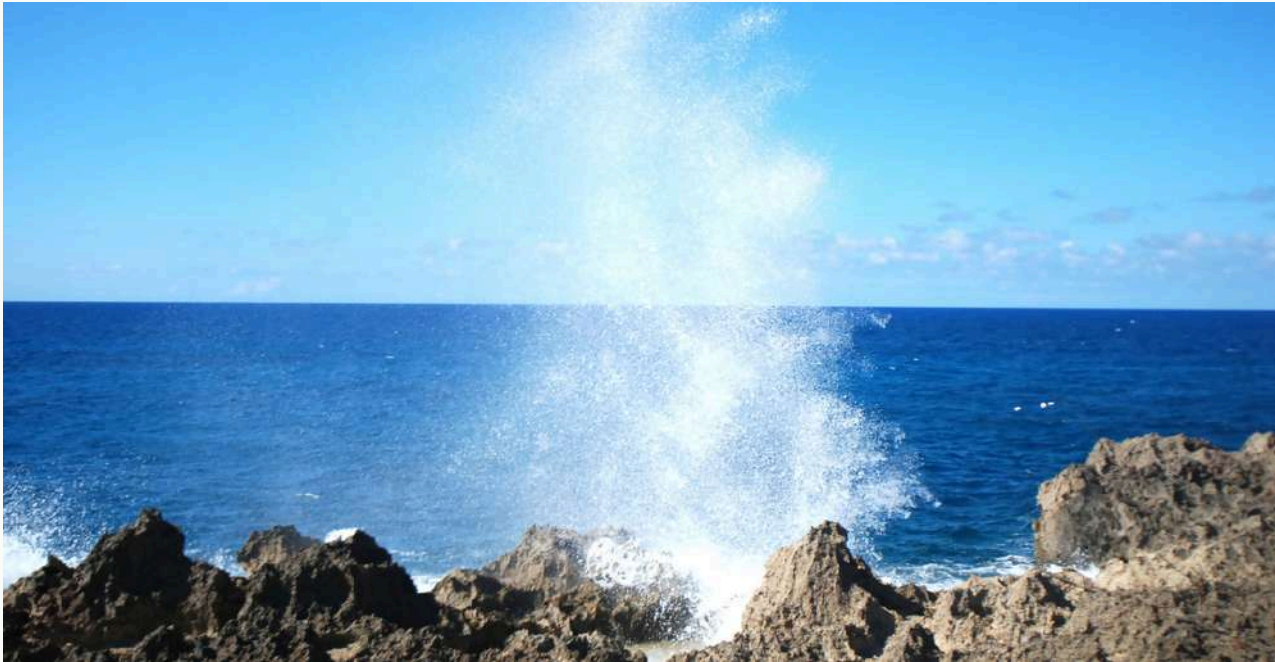
SEA SPRAY AT FOLLY RUINS, PORTLAND

Jamaica is known as the land of wood and water, a name well earned for its ecological diversity. The island boasts a slew of picturesque rivers, beaches and forests, limestone hills and natural wonders like Glistening Waters, Fire Water, healing hot springs, and landscapes shaped by time and story. It holds natural wealth, a certain je ne sais quoi , and cultural depth in equal measure, with compelling heritage—tangible and intangible—and remarkable people, together creating one of the world’s most influential cultures. Visitors come for it. Many across the world adopt it. As Jamaicans, we get to live inside it. Thus came the inspired hashtag, #ilivewhereyouvacation .